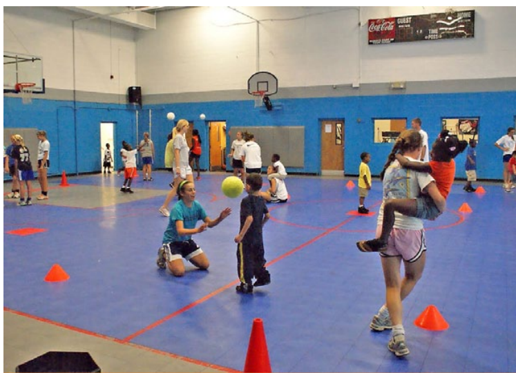
The PHS Varsity Girls Soccer team shared their love for the sport with children enrolled in a summer camp at the Boys & Girls Club of Trenton.