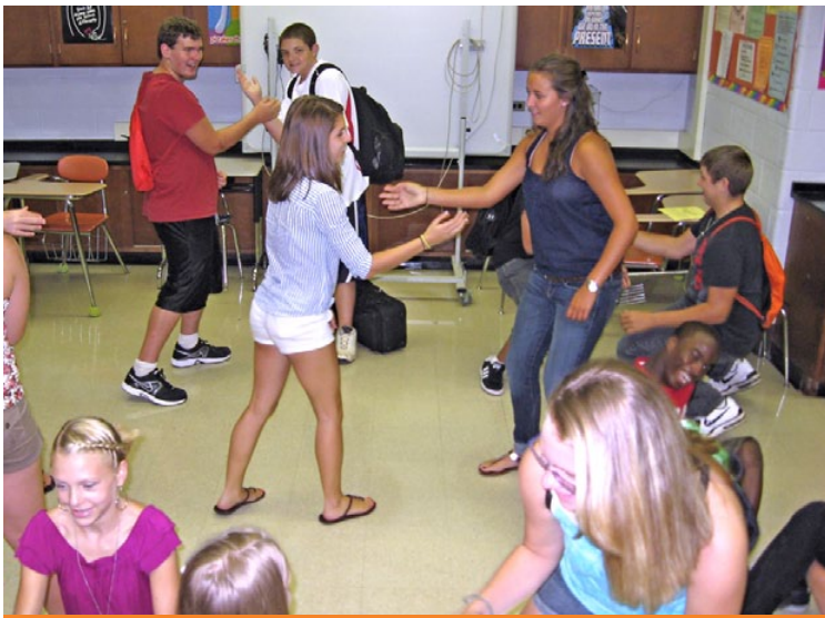
Freshmen entering Pennsbury High School transitioned to their new academic surroundings with an expanded orientation program.