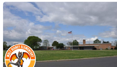
Walt Disney Elementary School

Visit our Instagram page here: Walt Disney Elementary School Instagram Page - psd_wdes