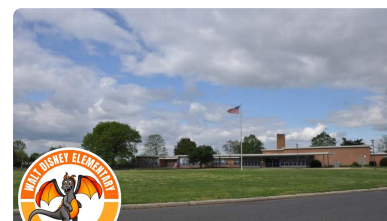
Walt Disney Elementary School

Visit our Instagram page here: Walt Disney Elementary School Instagram Page - psd_wdes